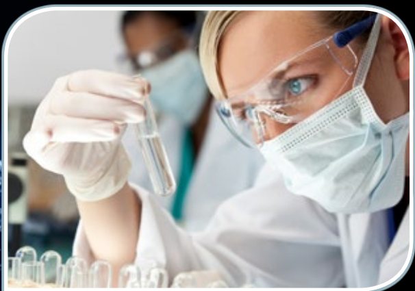
ULTRATHOR has been rigorously assessed by the independent APVMA

Similarly in a Soil Tunnelling study it was proven conclusively that the termites were unable to detect the presence of ULTRATHOR.